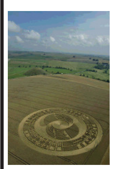
Crop Formation 2004

Wales, Glastonbury, Stonehenge, Avebury, Crop Circles Tintagel & Ancient Sites of Penwith, Cornwall