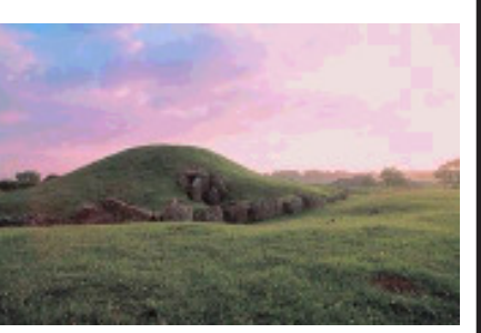
Bryn Celli Ddu, Anglesey, Wales