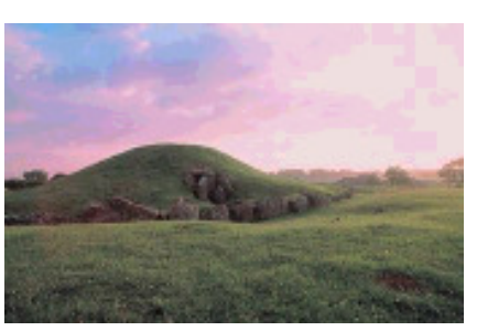
Bryn Celli Ddu, Anglesey, Wales