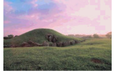
Bryn Celli Ddu, Ancient Mound, Anglesey, Wales