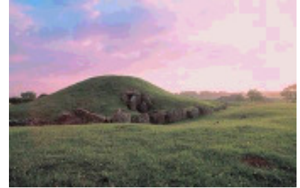
Bryn Celli Ddu, Ancient Mound, Anglesey, Wales