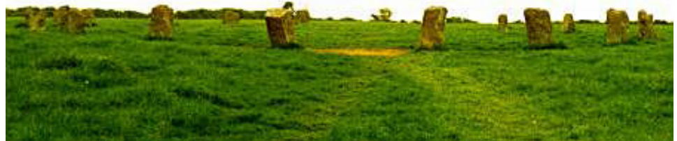
Merry Maidens, Cornwall