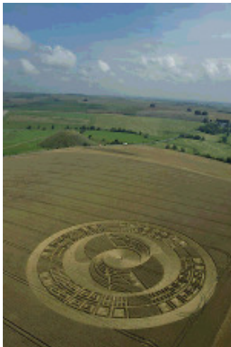
Crop Formation 2004

Salisbury Cathedral, Glastonbury, Stonehenge, Avebury, Crop Circles (if fields haven't been harvested yet) Tintagel & Ancient Sites of Penwith, Cornwall