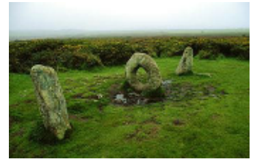
Men-an-tol Holed Stone, Cornwall