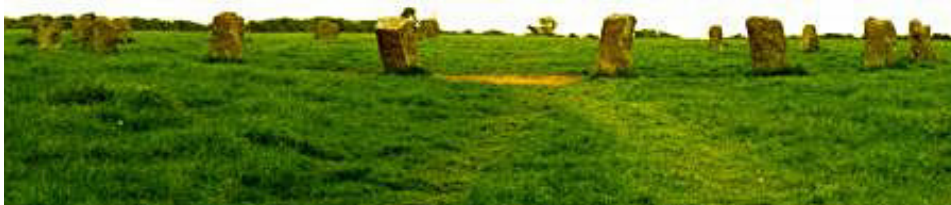
Merry Maidens, Cornwall

Tintagel & Ancient Sites of Penwith, Cornwall