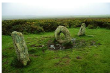
Men-an-tol Holed Stone, Cornwall