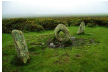
Men-an-tol Holed Stone, Cornwall