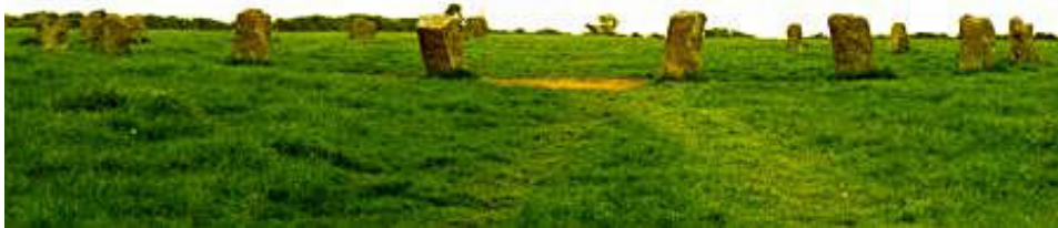
Merry Maidens, Cornwall

Tintagel & Ancient Sites of Penwith, Cornwall