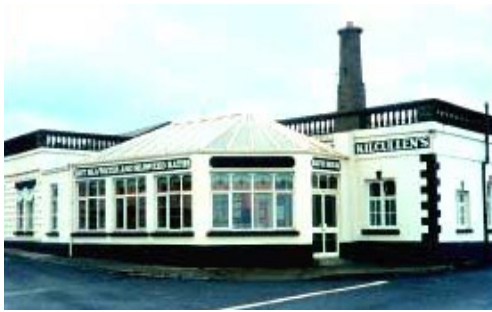
Seaweed Bathhouse Inishcrone

Go to http://www.wellwithin1.com/irelandB.htm