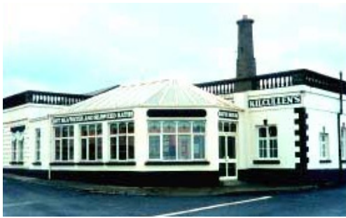
Seaweed Bathhouse Inishcrone

Go to http://www.wellwithin1.com/irelandB.htm