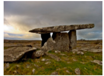
Poul nabrone Dolmen, The Burren

for website & links to sites we will visit & places we will stay