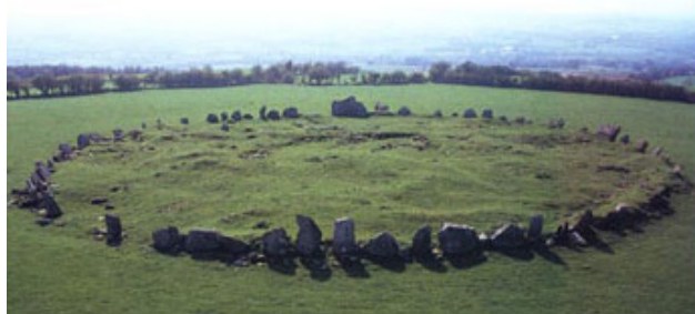
Beltany Stone Circle - Donegal County

June 25 - July 8, 2016 (13 nights) (Tour A NOT required before Tour B)