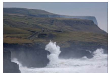
Cliffs at Doolin

IV. Deposit & Payments: $650 deposit secures space. Half of balance of payment due by 90 days before tour and remaining half of balance (full payment) due by 60 days before tour. Total $150 late payment fee added if payments not made by dates above ($75 for each payment not met).