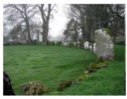
Lough Gur Stone Circle

Optional Extension to Kildare & Wicklow - July 4 - 8, 2013 (4 nights)