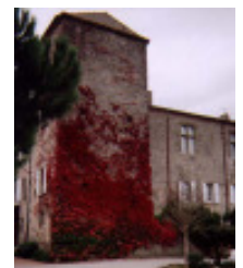
Chateau de Cavanac

* Accommodations (all tentative till registrations start coming in and the hotels are reserved) We will stay at Chateau de Cavanac with magnificent buffet breakfasts; in a Spa Hotel in the Pyrenees; 1 night near Toulouse airport at the end. ALL accommodations depend on availability.