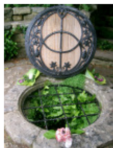
Chalice Well, Glastonbury

Costs: Starting at $1195 twin/triple/double occupancy + airfare (price depends on when you register); Single supplement - $200. Includes accommodations as registered for, breakfasts, transportation from & to Heathrow airport, entrance to sites listed, & workshops.